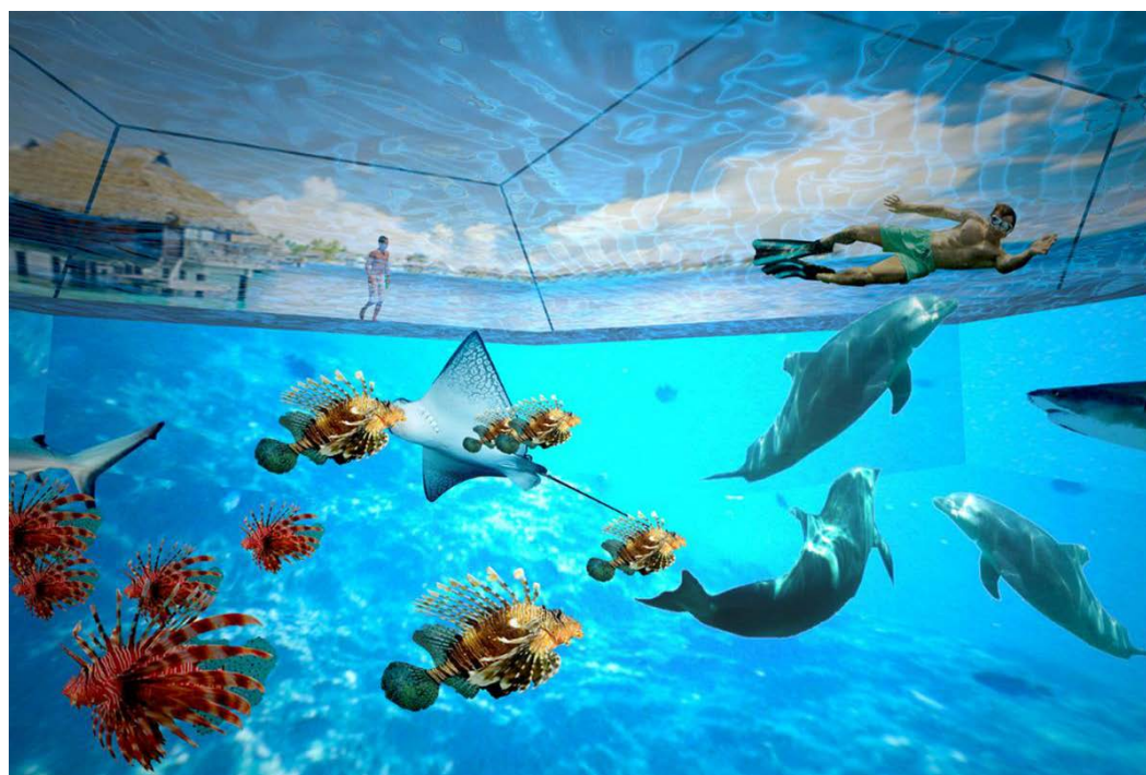
OVA Studio is currently seeking a partner to make the plans a reality

A prototype design for an attraction, conceived by Hong Kong's OVA Studio, could recreate the world's oceans, using projected imagery on LED screens to bring the Bahamas, Maldives, Great Barrier Reef and more to a uniquely designed swimming pool.