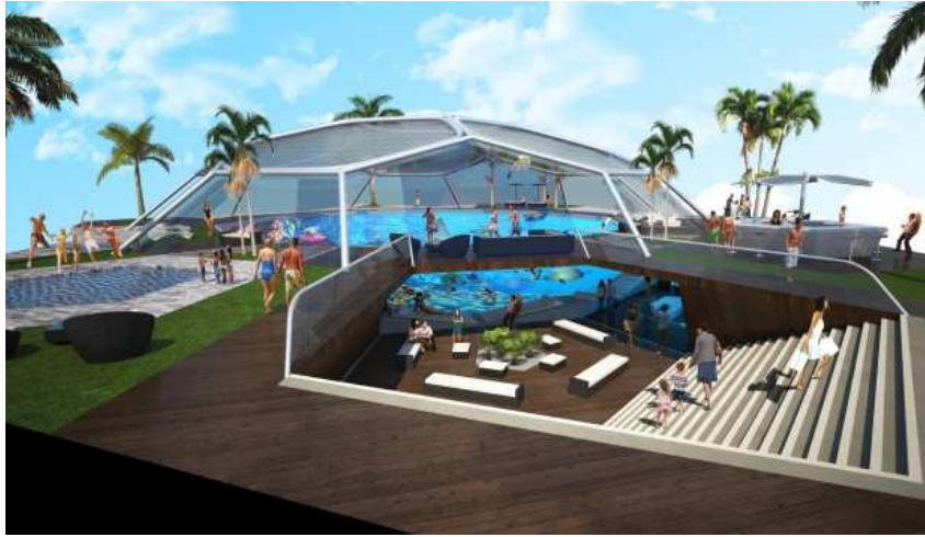
THE TWO-STORY COMPOUND CONSISTS OF A MAIN POOL FITTED WITH TEMPERED GLASS INCORPORATED WITH LED SCREENS, AND A VIEWING LOUNGE AND SPA IN THE BASEMENT. ILLUSTRATION: OVA STUDIO