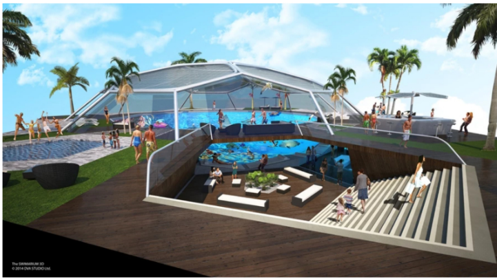
The Swimarium concept has LED screens all around the pool to create an immersive swimming experience

The Swimarium would have each of its sides, its bottom and a ceiling dome all formed of glass with LED screens behind. The screens would be used to show panoramic content from dive sites around the world to give pool users the sense of being there. Video shown could be pre-recorded or, with the right technology, could show live feeds from the chosen sites.