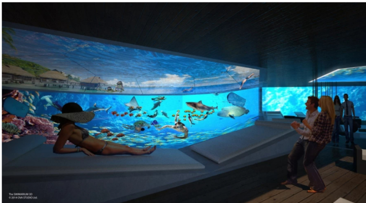
OVA says pre-recorded video could be shown on the LED screens of live video feeds from dive sites around the world