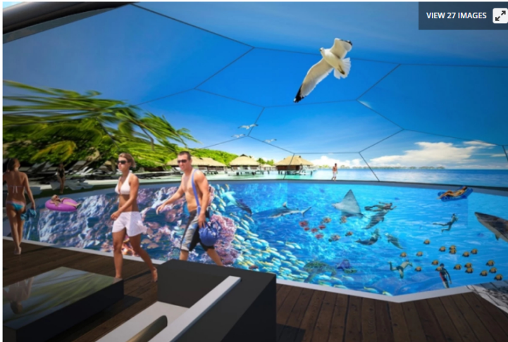
OVA Studio's Swimarium is a swimming pool surround by LED screen on which footage from dive sites around the world can be shown

If you've ever fancied scuba diving at the Great Barrier Reef but can't afford it, this idea from OVA Studio might provide a solution. The Swimarium is a design concept in which LED screens are placed all around a pool to create an immersive virtual swimming experience that would let you dive anywhere in the world.